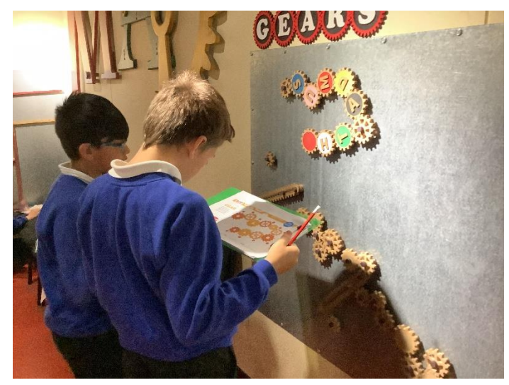
I had a lovely email from the Museum congratualting the children on their excellent behaviour and conduct - well done Year 5.