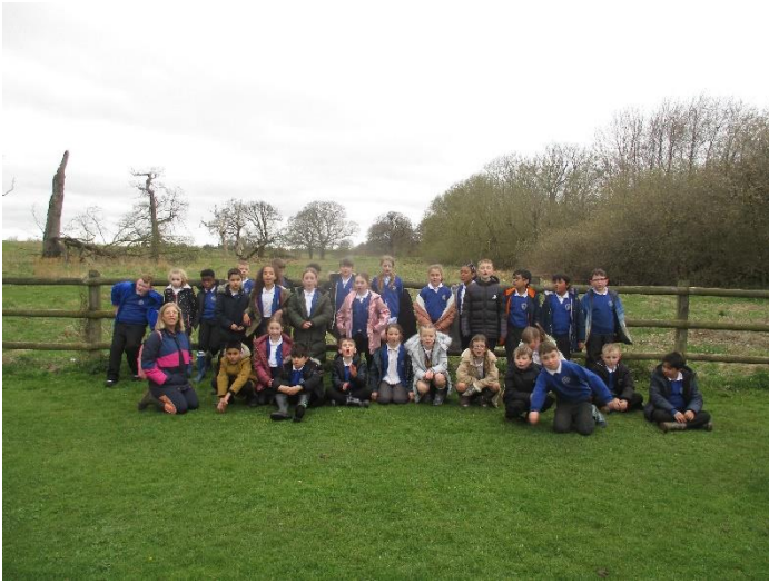
Year 5/6 visited The Ackers to participate in rock climbing, abseiling and canoeing - all good fun.