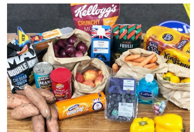
Example of a £3 shop

Our members not only get to save on their food shop but they also get to play their part in helping to protect the environment. Lots of the items in our grocery have been given to us by local supermarkets and would have normally ended up going into landfill. The food is all great, and there are many reasons why supermarkets have surplus food to donate. It may be there are packaging mistakes, errors with ordering or that the food that ends up too close to its 'best before' date for them to sell. So they've given it to the Community Grocery.