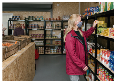
Inside a Community Grocery