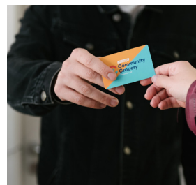
Your membership card