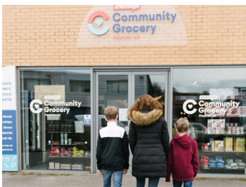
The first Community Grocery

We know choosing the items you like for your family is really important and so we have thousands of products to select from each week with new lines added each day.